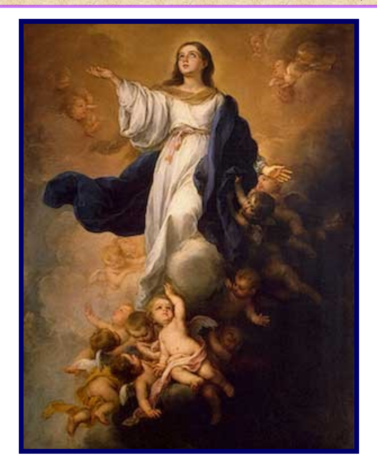
O Mary, conceived without sin, pray for us who have recourse to thee.