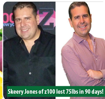
Skeery Jones of z100 lost 75lbs in 90 days!