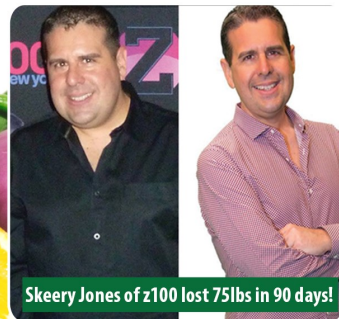
Skeery Jones of z100 lost 75lbs in 90 days!