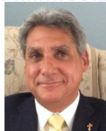
EMMAUS MISSION AWARD

When: Sunday, November 24, 2019 12:00- 4:00 p.m. Where: Crest Hollow Country Club, Woodbury, NY Cost: $100 per person