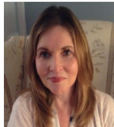
POPE JOHN XXIII Humanitarian Award