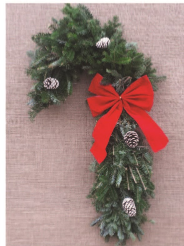
Decorated Candy Cane