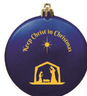
3" Ornament (Blue or Red)