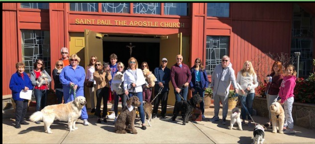
2019 Blessing of the Animals

From the Pastor October 13, 2019 Twenty Eighth Sunday in Ordinary Time Eighteenth Sunday after Pentecost