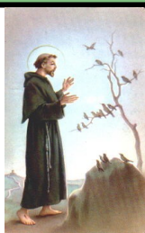
Feast of St. Francis of Assisi