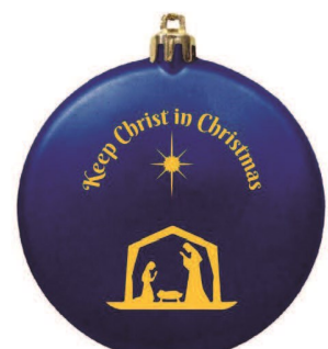
3" Ornament (Blue or Red)