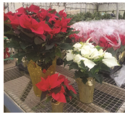
10", 4" and 6" Pots