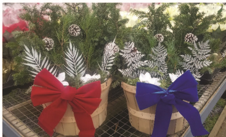
Decorated Bushel Basket with Red or Blue Bow