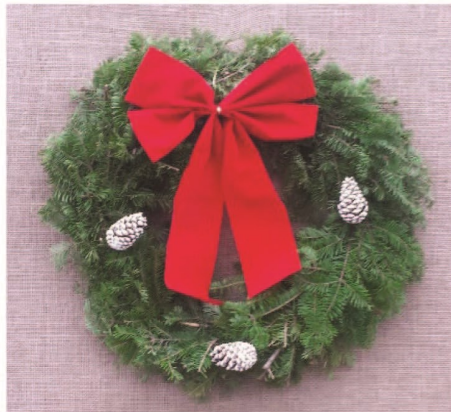
12" Decorated Wreath