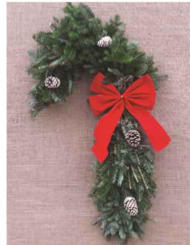
Decorated Candy Cane